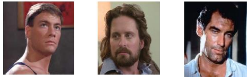
Figure 4. Sample face images from AgeDB.

AgeDB: This database contains 16,488 images from 568 different people captured in real-world conditions. Hence, the images of this database may include different poses and expression, noise, occlusions and any uncontrolled conditions. Hence, this database would be used for training and testing the deep neural networks. Also, the age range of this database is from 1 to 101 years. The average number of existing face images and the average age range for each person are 29 and 50.3 years, respectively. Figure 4 shows some sample images from this database.